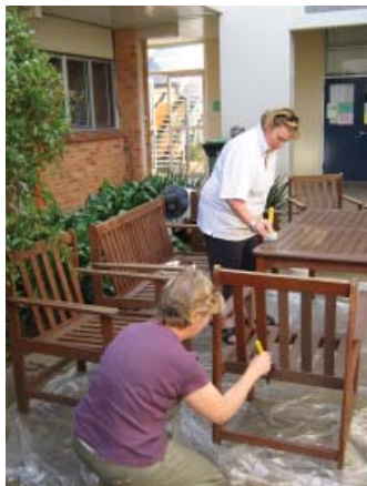
P&F Parents painting at working bee held on Sunday.

Our staff have been preparing displays, demonstrations and activities to help give an insight into the working life of the College. The College P and F have also been very busy. They held a very successful Working Bee last Sunday and repainted all of the outdoor furniture in the Science Quad. This Sunday they will be cooking a family BBQ from 12.30pm in our Science Quad. So, see you on Sunday for a chat.