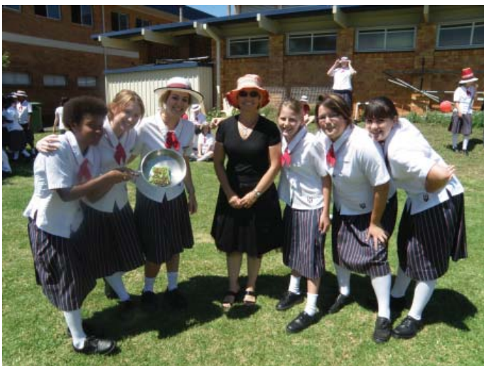
Pancake Day The Winners! M1.